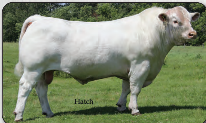
PLEASANT DAWN CHISUM 216A Polled