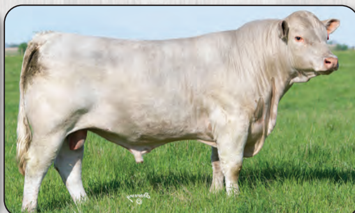
PLEASANTDAWN SERENITY 507G Polled

Chisum is a true curve bender, from calving to performance with good maternal. He has been used all around the world.