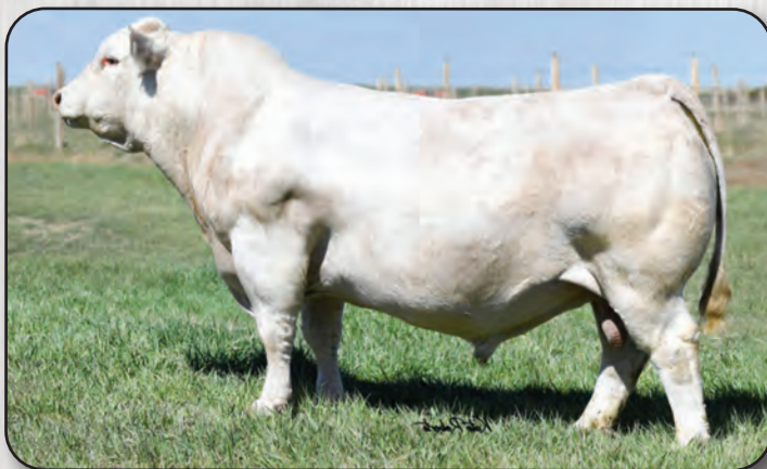
LT AFFINITY 6221 PLD Polled

This high selling bull from Turnbull's sale has excellent calving to growth traits. Used to add the combination of extra length and depth of rib.