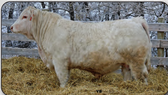
PLEASANTDAWN CONNECTION 195G 4th Gen Pld