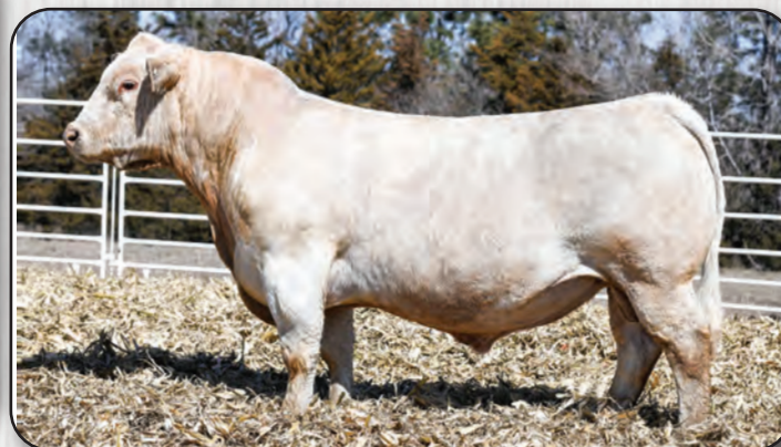
CCC WC RESOURCE 417 P 3rd Gen Polled

He sires calves with lots of length, strong topline and good muscle.