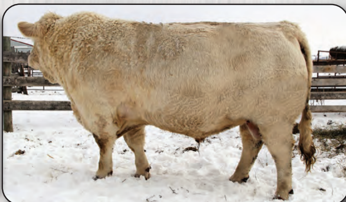
MAIN MAGICO LANZO 36D Homo Polled

Affinity has good early gestation for calving ease and great temperament.