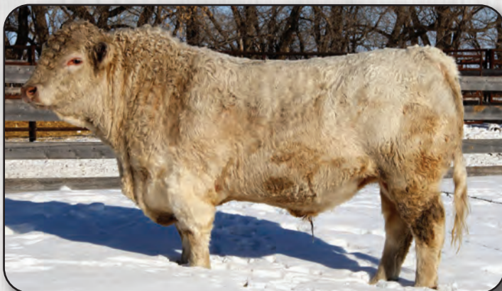
TURNBULL'S FULL MOON 655F Homo Pld

Will add calving ease, extra rib, with top marbling calves, with top maternal traits and great feet.