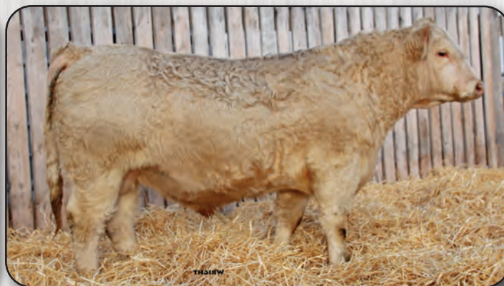
TURNBULL'S GROUND BALL 740G Polled

Morgan gives us the red gene while adding good feet with structural correctness. Also calves very well with excellent performance. One of the best Homozygous Red bulls we've used.