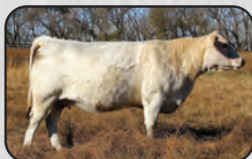
Dam - TLJ 916F