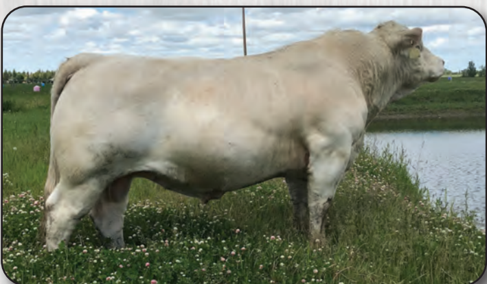
SADDLERIDGE FREIGHTER 1F Homo Polled

The best heifer bull ever used at Pleasant Dawn. After 2 years, still 100% unassisted and still leaves good performance and muscle.