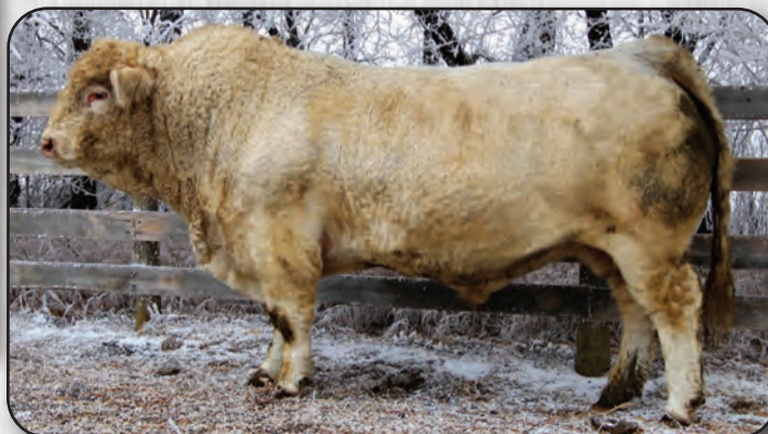
PLEASANT DAWN CHRIS 42E Homo Polled

10 sons sell - Magico was also a high seller at the Char-Maine bull sale. Definitely a bull to leave a long lasting impact. His attributes include calving ease and performance with maternal and structural correctness. Great temperament and is leaving females with small teats with lots of milk.