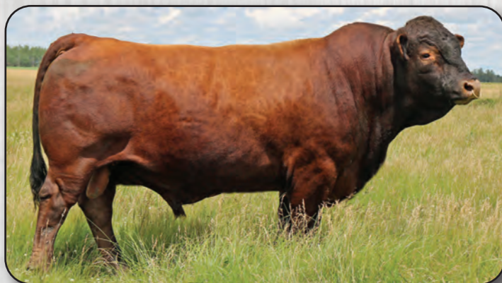
TRI-N CAPTAIN MORGAN 340A Homo Polled